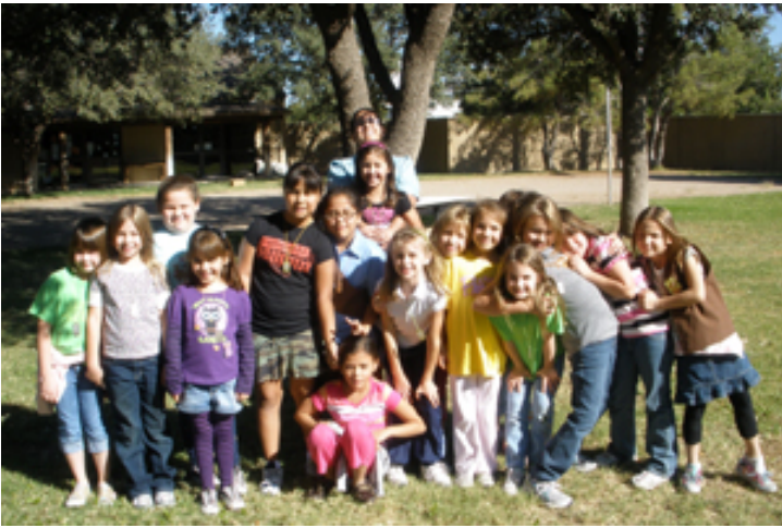
The GSDSW In-School Scouting program offers girls fun and educational workshops - like this yoga session in El Paso, TX - during the school day.