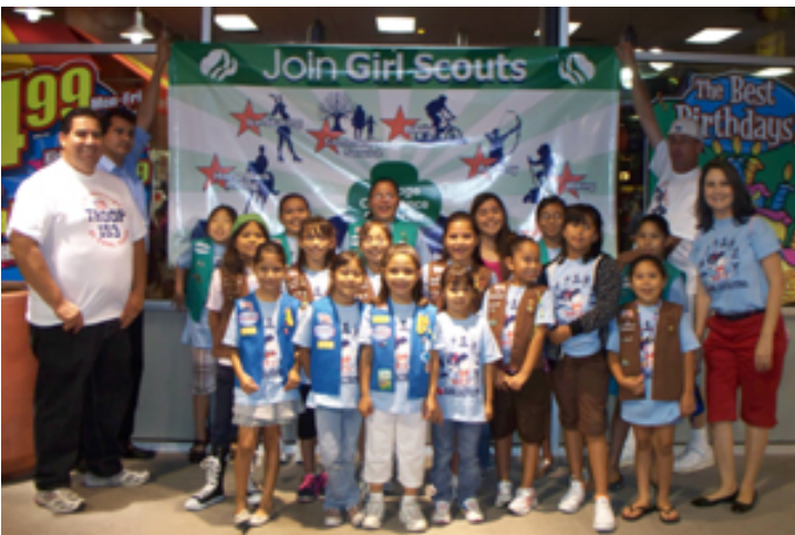
Girl Scout Troop 153 (Indian Summer SU) at Girl Scout Night at Peter Piper Pizza in El Paso, TX on October 6, 2010.