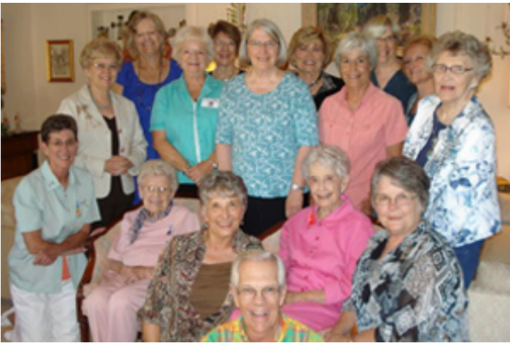
Once a Girl Scout, Always a Girl Scout. Troop 20, which has been meeting for 60 years, hosted a very special reunion in Artesia, NM on September 18, 2010. More information: Click here to view an article in the Artesia Daily Press.