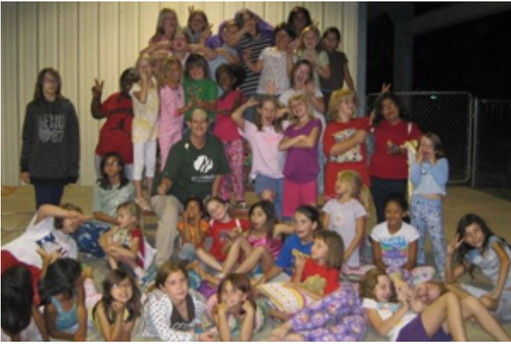
Girls learning all about camping at the Camp Like a Girl event in Carlsbad, NM.