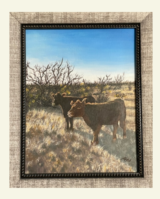
"Good Moooooning" by Thais Ahlstrand 8.5" x 11" original painting