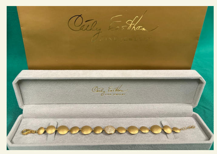
Marika Desert Gold 14KT Yellow Gold Dome Circle Bracelet Featuring 1 Pave Diamond Station Weighing a Total of 0.32cts