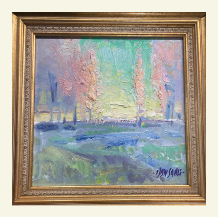
"Frosty Morning - Warm Frost" by Don Sahli 10" x 10" original oil painting