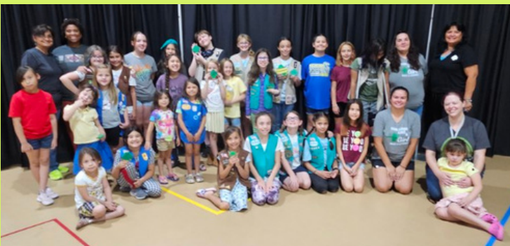
Las Cruces Lego Derby