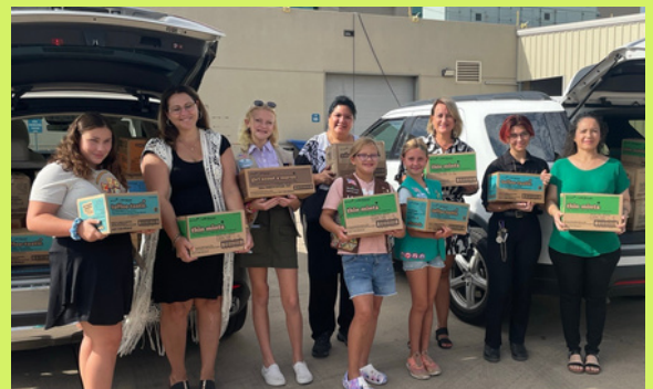
Care 2 Share program